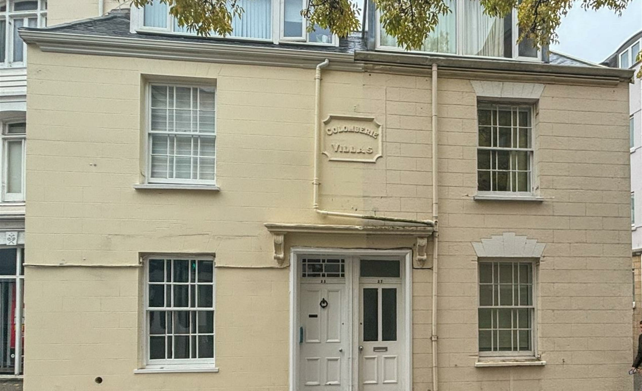
Flat 2 27 La Colomberie, St Helier, Jersey, JE2 4QB £429,000